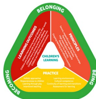
Figure 1: Elements of the Early Years Learning Framework

We acknowledge that children learn in a variety of ways and vary in their capabilities and pace of learning. Over time children engage with increasingly complex ideas and learning experiences, which are transferable to other situations.